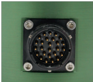
Strain gage output