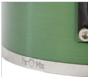
Direction of action