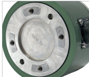
Robot flange in accordance with DIN ISO 9049-1